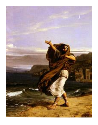
<u>Demosthenes Practising Oratory</u> (1870)

Pick out 1-3 things that interest you, that are related to the class, that you think might make a good Class Project. This Project is something with which you should be able to have fun.