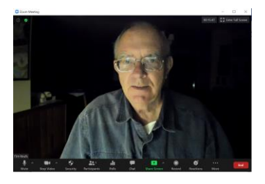
Live Chat is optional.