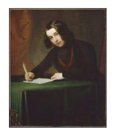
Charles Dickens (1842)